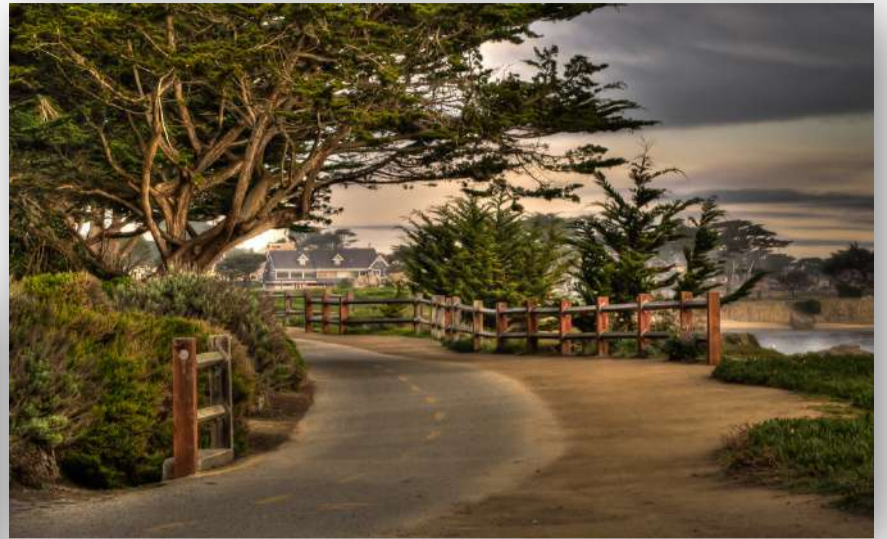
Pathway Curves Above Lovers Point Beach