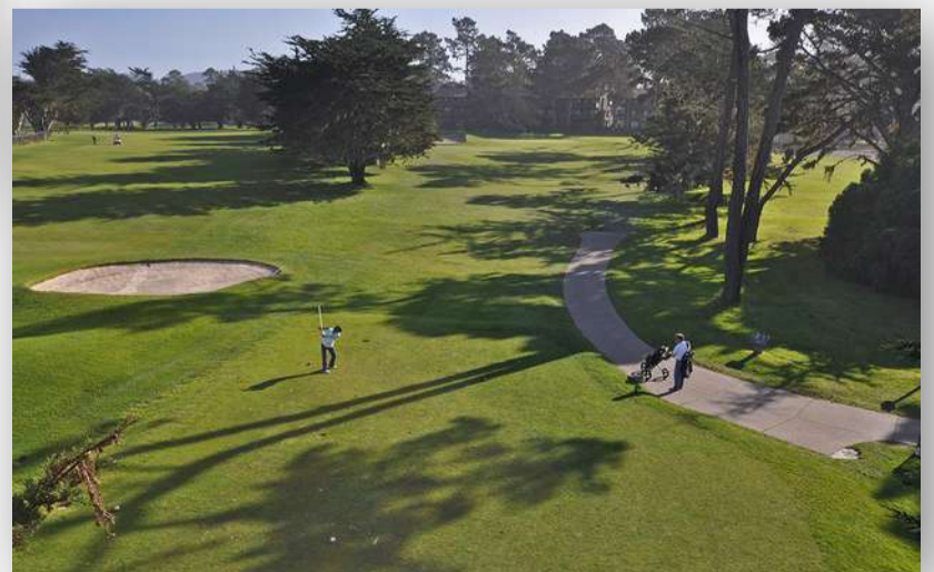
Teeing off at Hole #2 PG Golf Course