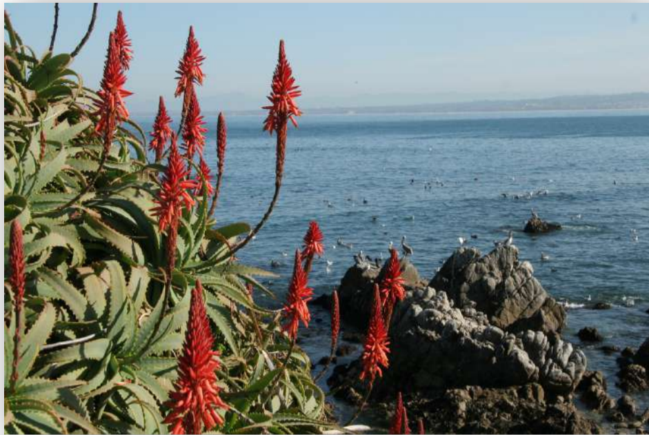
Aloe Flowers at Pacific Grove