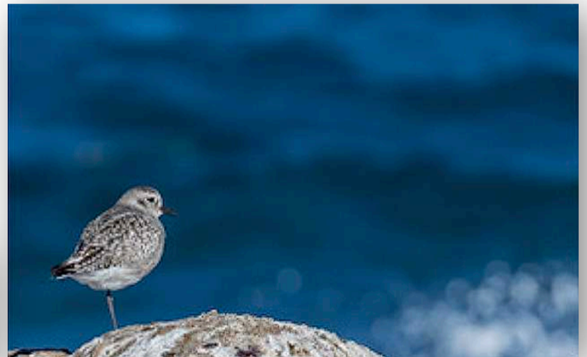
Migrating Black-bellied Plover on a Layover in PG