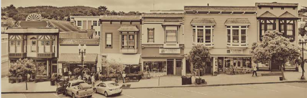
PG Then and Now