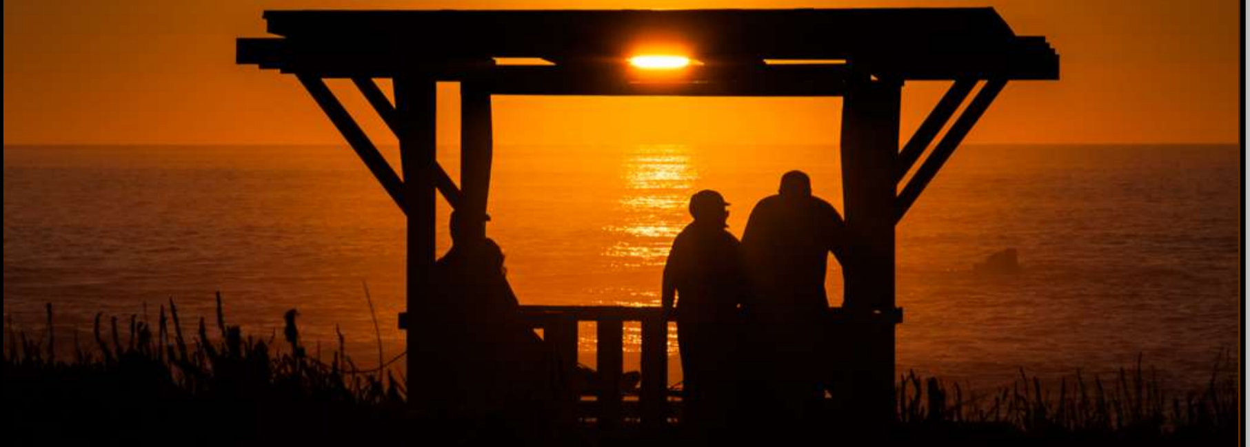
Rocky Shores Gazebo at Sunset Asilomar State Beach

Celebrating the things that make PG a very special place.