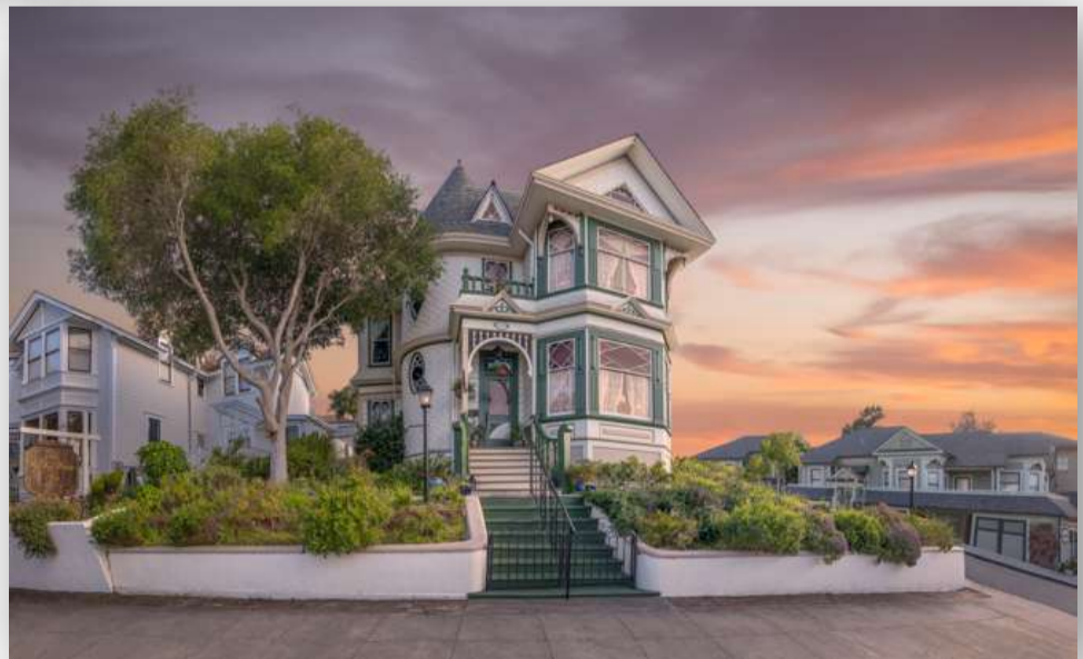
Hart Mansion 1893