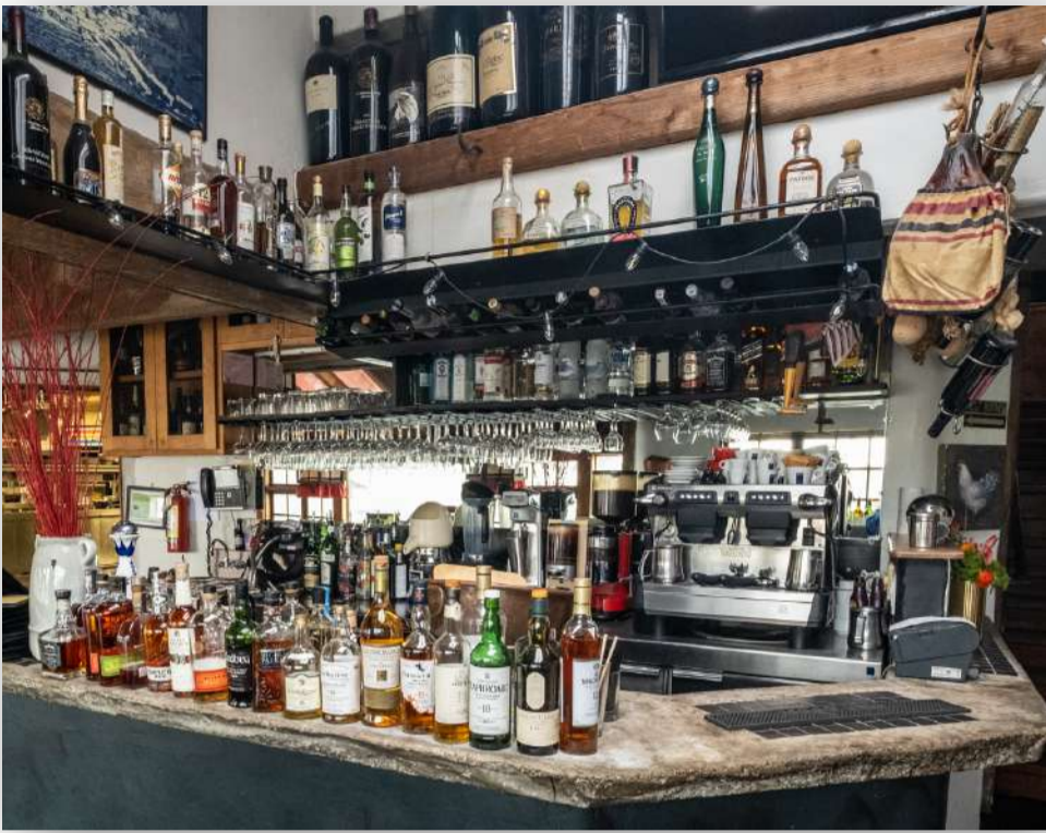
Have a Drink at Fandango