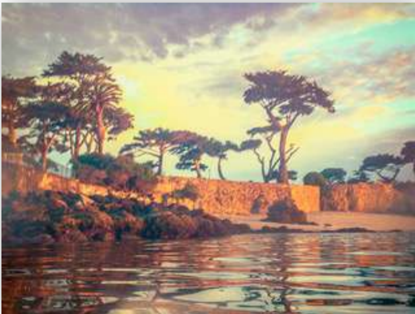
Lovers Point Landscape at Sunrise