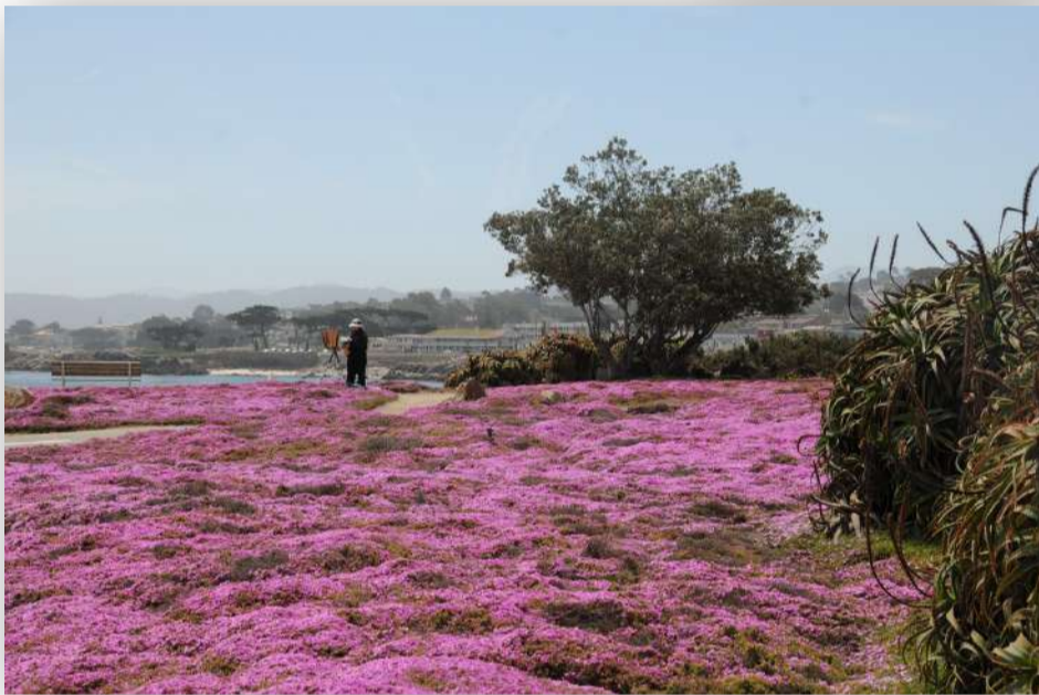
Pacific Grove Ice plant