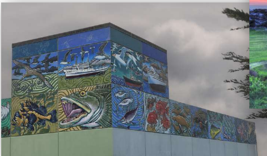
PG NOAA Building