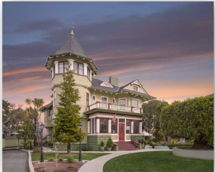
Osborne House 1910