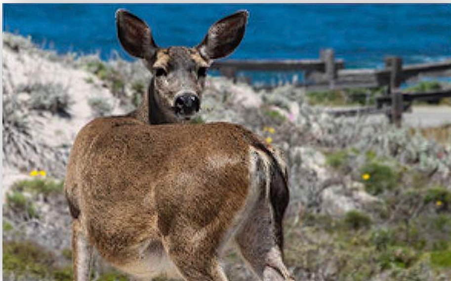
PG Resident Browses Spring Flowers