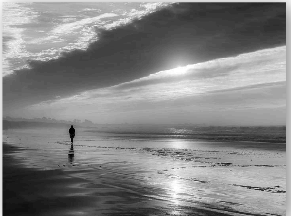
Asilomar at Sunset