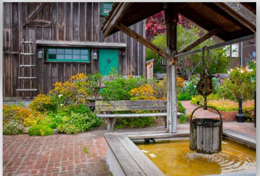
Wishing Well at Pacific Grove Heritage Society