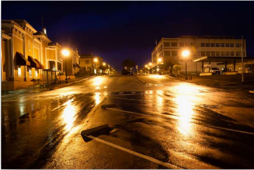
Rainy Night on Lighthouse Avenue in Pacific Grove