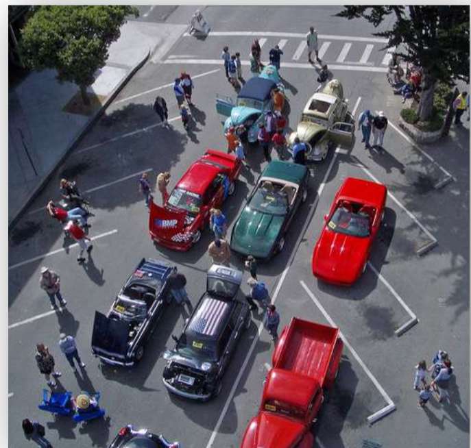
Concours Auto Rally on Lighthouse Avenue