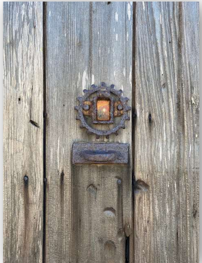
Rusty - PG Heritage Society Barn Detail