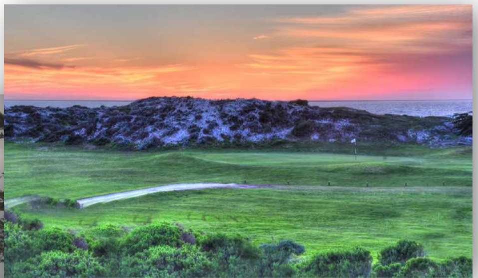
Pacific Grove Golf Course at Sunset