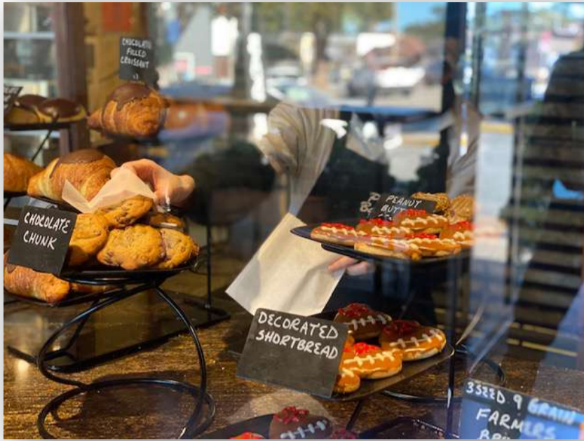
Pavel's Backerie Tasty European Style Baked Goods