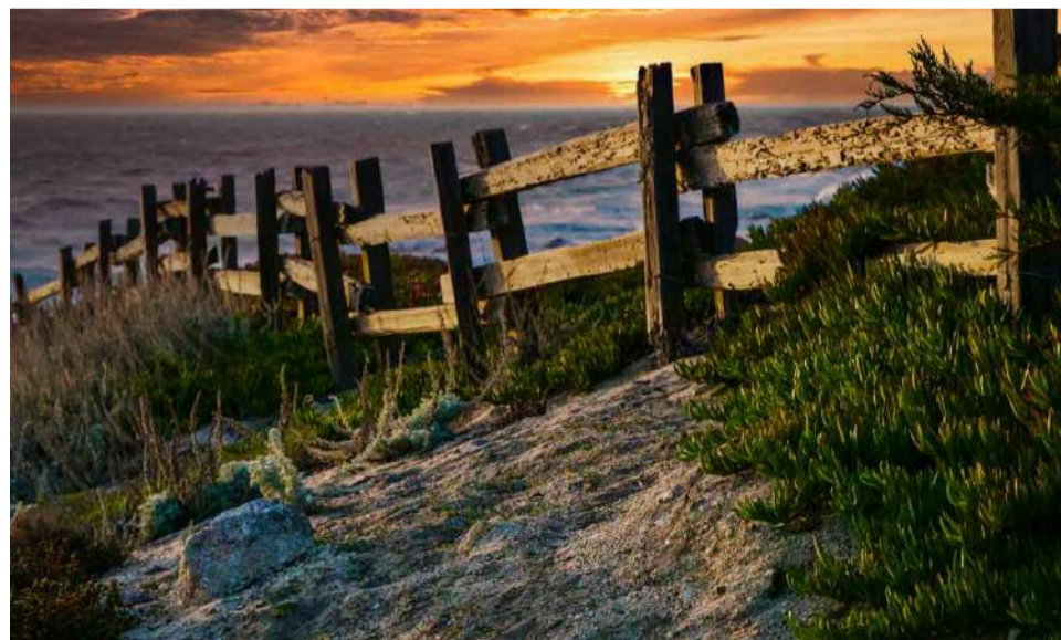
Fence to Nowhere