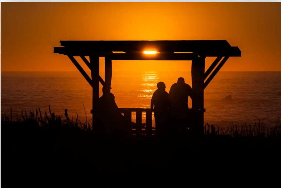
Rocky Shores Gazebo at Sunset, Asilomar State Beach